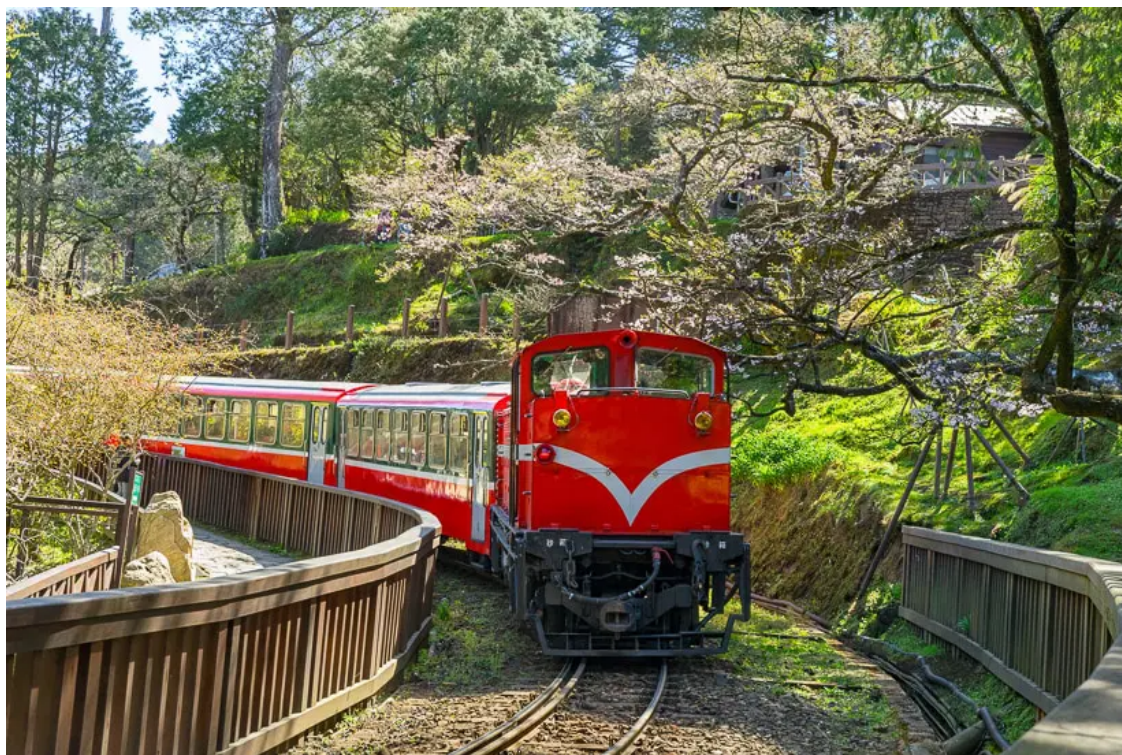
The classic view of Alishan: cherry blossoms above an the Alishan train

One of the most incredible times to visit Alishan is when the cherry blossoms are blooming (see my Taiwan cherry blossom guide ). Due to the altitude, this happens very late in the season, usually March and April (depending on that year's weather), and marks the end of the cherry blossom season in Taiwan.