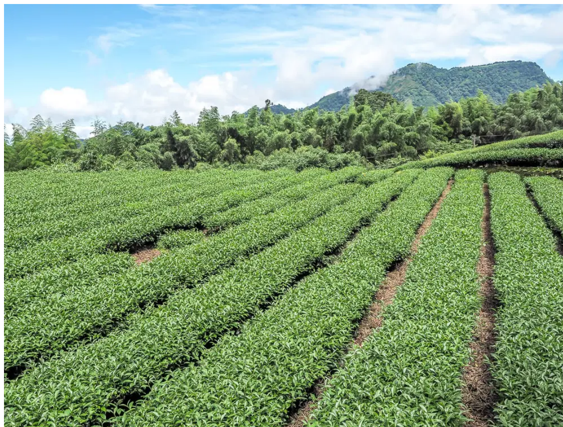
Field of Alishan High Mountain tea, shot from this hotel (see details below)

However, most tourists pass right through the tea growing area without even realizing it. Most Alishan tea is grown not in Alishan National Scenic Area, but around Shizhuo (Shizhao) village further down the mountain.