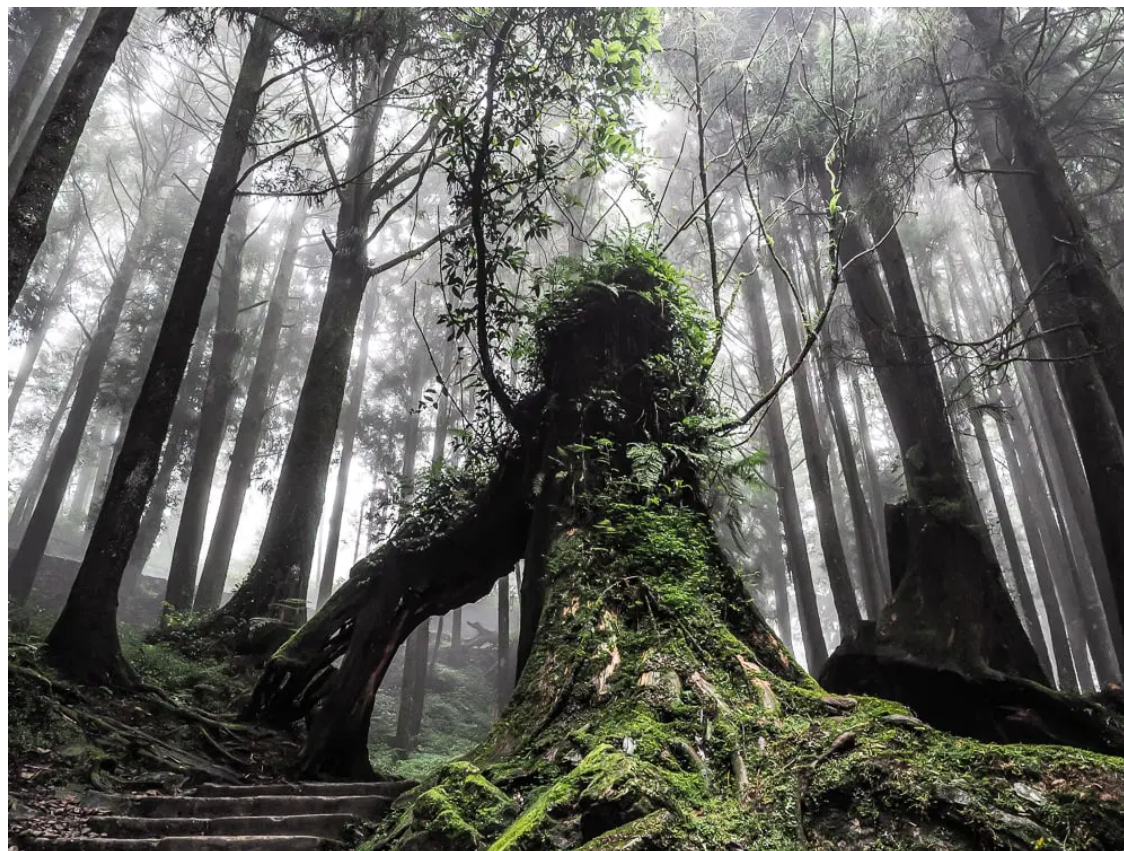
Alishan's haunting, mist-filled, ancient cedar and cypress forests