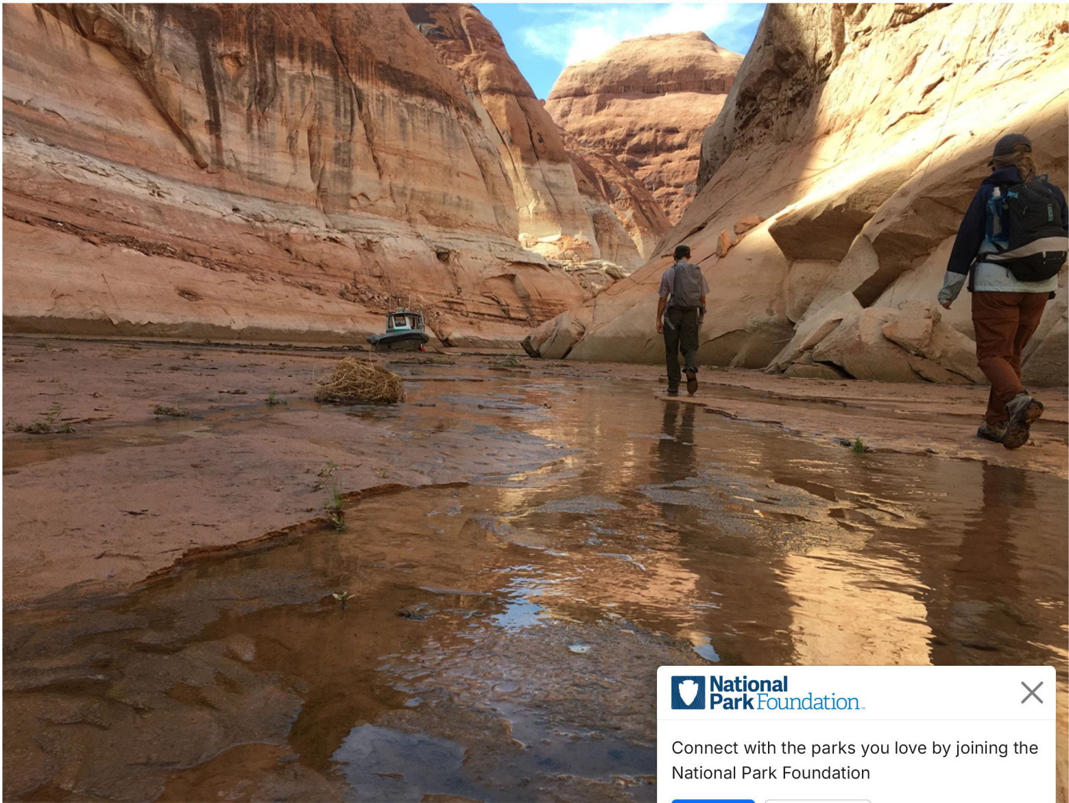
Park rangers walk back to the boat from Rainbow Bridge at lake elevation 3529'. The water did not reach the shore through the wet muck.