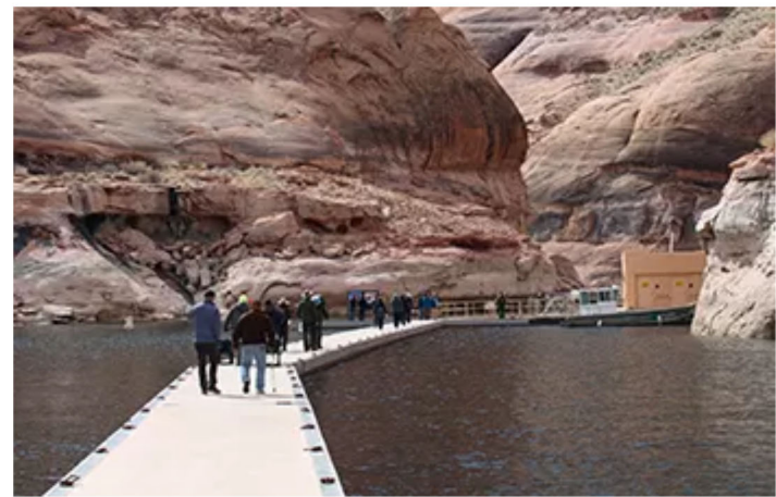
The floating restrooms at the dock are the only facilities in the monument.

At current lake levels, the dock at Rainbow Bridge does not reach land. Beach your boat and walk through muck to the trail at your own risk.